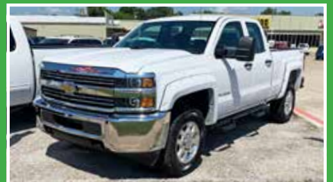
2015 CHEVY 2500 4X4