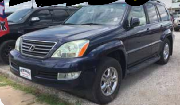
2006 LEXUS GX470