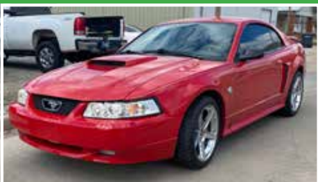
2004 FORD MUSTANG GT

STOP BY TODAY FOR A SIMPLE & STRESS-FREE CAR BUYING EXPERIENCE!