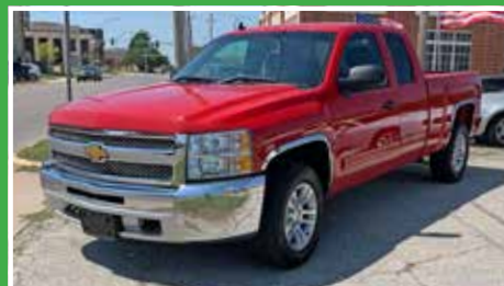
2007 CHEVY SILVERADO Z-71