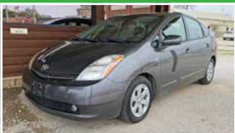
2009 TOYOTA PRIUS