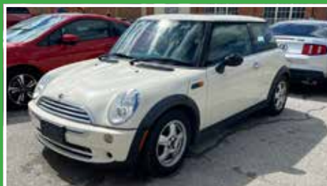
2005 MINI COOPER