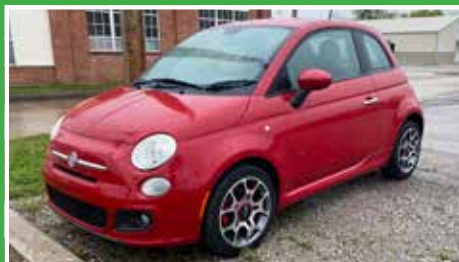
2012 FIAT 500 SPORT