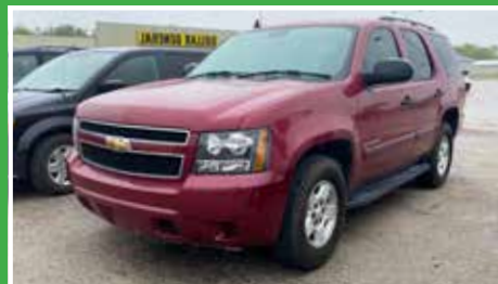
2007 CHEVY TAHOE