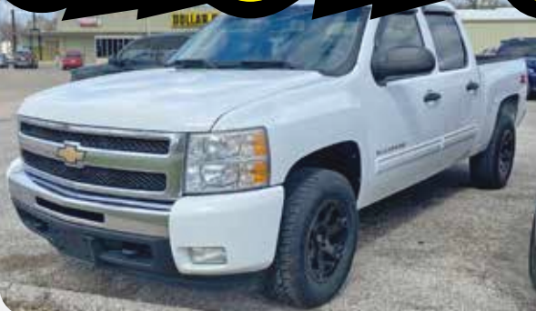
2011 CHEVROLET SILVERADO Z-71

WE'RE LETTING THESE 3 GO AT UNBELIEVABLE CASH PRICES!