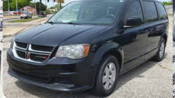
2012 DODGE GRAND CARAVAN

STOP BY TODAY FOR A SIMPLE & STRESS-FREE CAR BUYING EXPERIENCE!