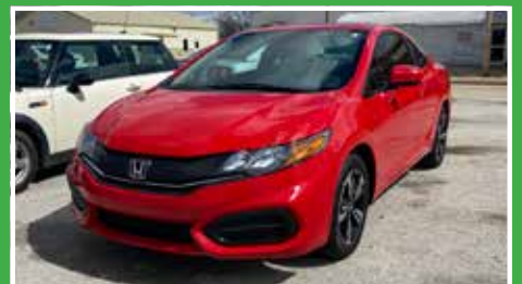
2015 HONDA CIVIC