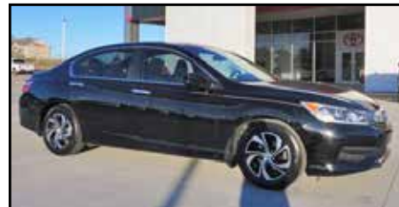
2016 HONDA ACCORD CLEAN CARFAX