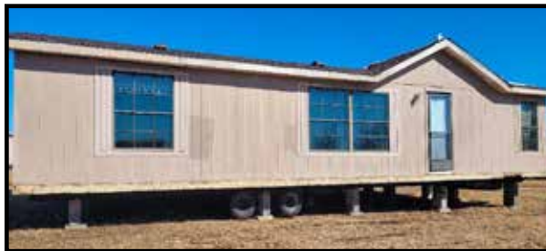
1991 SKYLINE 28X48 • 3 BED, 2 BATH • AS-IS $15,000