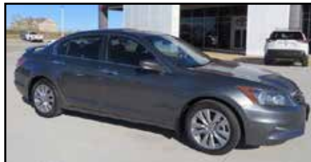
2011 HONDA ACCORD EX-L CARFAX ONE-OWNER