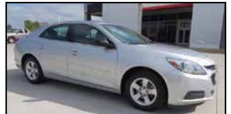
2016 CHEVY MALIBU CLEAN CARFAX