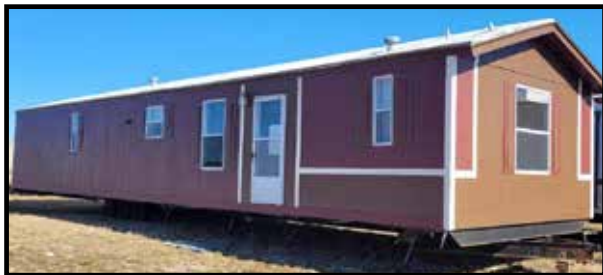
1999 SILVER CREEK 16X60 • 2 BED, 2 BATH $17,900

THE LARGEST USED HOME DEALER IN OKLAHOMA!