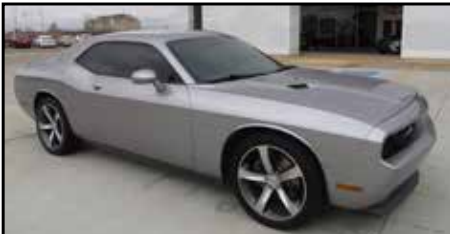
2014 DODGE CHALLENGER LOCAL TRADE

GET BACK ON THE ROAD WITH $10000 DOWN! (WAC)