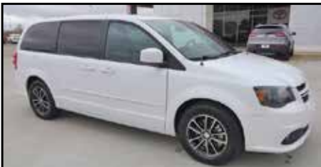
2017 DODGE CARAVAN CLEAN CARFAX