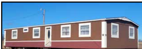
1975 CREST HOMES 24X56 • 3 BED, 1 BATH $19,900