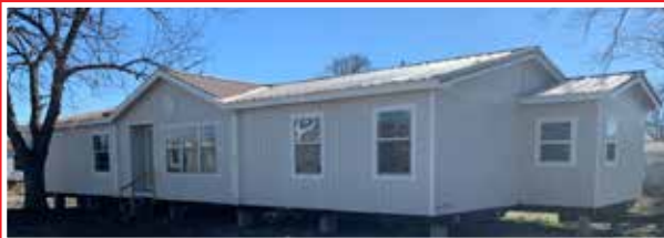
32X70 • 4 BED, 3 BATH • THERMAL WINDOWS HARDWOOD CABINETS • TAPED & TEXTURED 2X6 WALLS • FIREPLACE