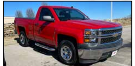
2014 CHEVY SILVERADO 5.3L V8! ONLY 24K MILES!