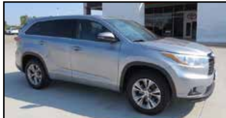
2015 TOYOTA HIGHLANDER CARFAX ONE-OWNER