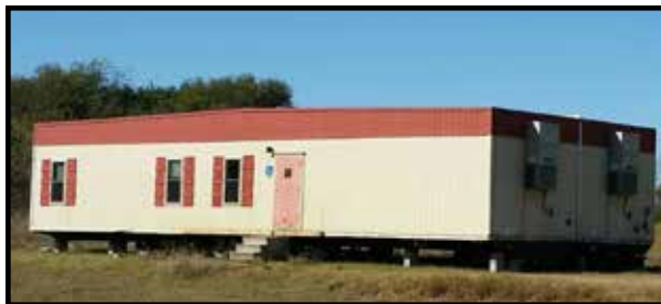
2008 NORTEX 28X60 MODULAR OFFICE BUILT-IN HEAT & AIR PERFECT FOR SMALL BUSINESS $24,900