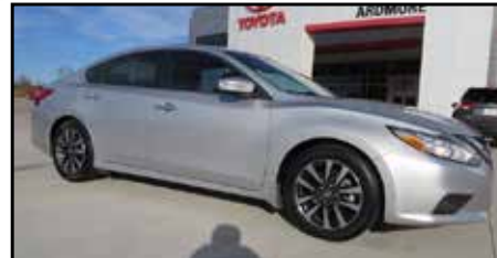
2017 NISSAN ALTIMA SV CARFAX ONE-OWNER